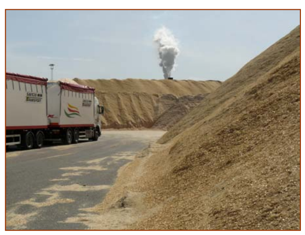
Piles of shredded wood at a large pellet manufacturing facility.

Many methods exist to process woody biomass into some sort of feedstock. Much of the handling and processing can occur in the forest. In other cases, processing may occur at a mill site to better control feedstock specifications. The movement of woody biomass from the forest to the mill is called a supply chain. Supply chains can be complicated or simple, depending on what form of feedstock is needed and what sort of demands a particular mill might have. Other factors include the condition of the logging infrastructure, the transportation network, the