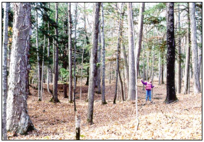
Northern hardwood forest, the most common forest type in Michigan.

Stated most simply, biomass is tissue produced by living organisms. In an ecological sense, it is usually measured in dry weight per unit area, such as tons per acre. In a forest, trees produce huge amounts of biomass. Wood is one form of that biomass, along with leaves, bark, flowers, fruit, etc. Woody biomass has been used by humans for millennia for a variety of purposes. Wood is one of the most common (and ecologically friendly) raw materials that society uses. In current markets, and with growing concerns about carbon and fossil fuel consumption, biomass has come to mean a potential alternative fuel source for energy. Of course, woody biomass has been used as an industrial and residential fuel for a long time. Yet, emerging technologies are changing the face of that market.