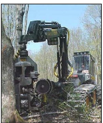
Harvesting processor at work.

The kind of product manufactured in the woods is important to mills that produce the next value-added product, such as pellets, heat, power, ethanol, or chemicals. In addition to various kinds of chips, grindings, shreddings, bundles, etc., the species mix can make a difference. For example, broad-leaved trees