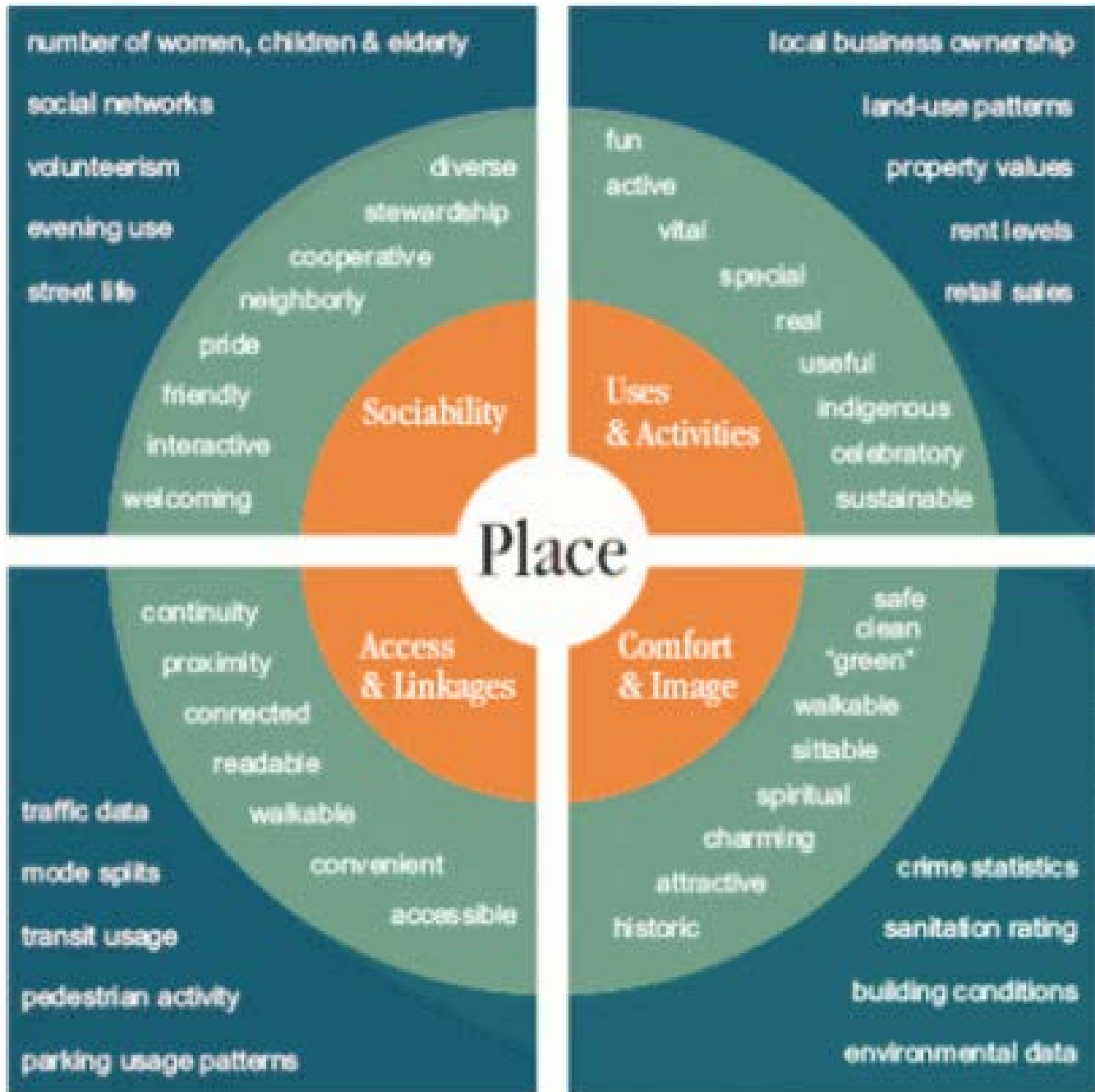
Figure 2: Components of placemaking | Graphic by Glenn Pape of MSU Land Use Institute from a similar graphic by Project for Public Places, New York.

The most important thing about “quality place” is that each community has its own unique characteristics. Each community has its own set of assets and attributes that are genuine for that community. One should build on those unique assets to enhance and build place.