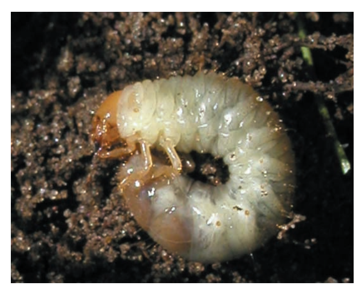
Figure 3. Fully grown third instar grub of Japanese beetle.

Larvae (also known as grubs) are 2 to 3 mm long when newly hatched; fully grown larvae are about 30 mm long (Figure 2). Larvae are C-shaped and white with a brown head capsule and three pairs of legs (Figure 3).