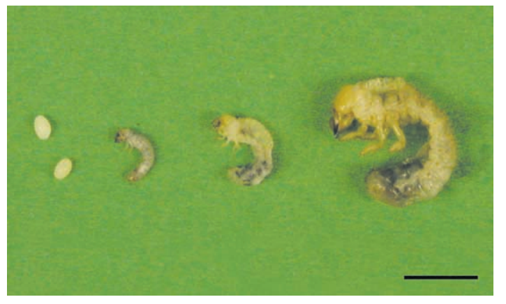
Figure 2. Relative sizes of eggs and first, second and third instar Japanese beetle grubs. Bar = 5mm.