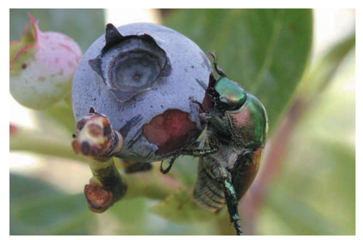
Figure 1. Adult Japanese beetle feeding on ripe blueberry.

Eggs are 1 to 2 mm in diameter, spherical and white (Figure 2). Females lay batches of eggs 5 to 10 cm below the soil surface, generally in areas with grass and moist soil.