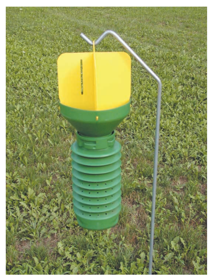
Figure 6. Monitoring trap for Japanese beetle.

Cultural control. One of the most effective control tactics is to make crop fields and nearby areas less suitable for Japanese beetle by integrating many cultural approaches into regular horticultural prac-