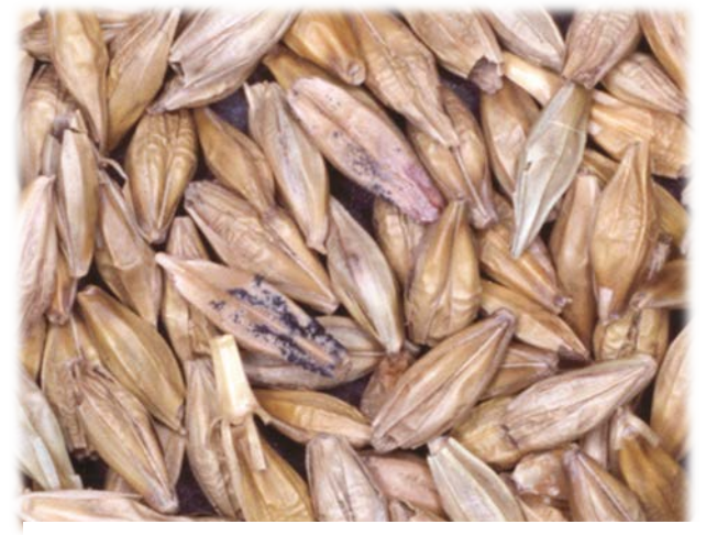
Infected kernel may be shrunken and appear bleached or pinkish in color; and eventually may take on a sooty appearance

Fungicide use is encouraged as it may reduce the severity of FHB by 20 to 50 percent and DON levels by 40 to 60 percent, although the actual reductions are highly variable. Using recommended fungicides also tends to boost yields by significantly reducing the severity of various leaf diseases that often attack barley. To improve an application's effectiveness against FHB: