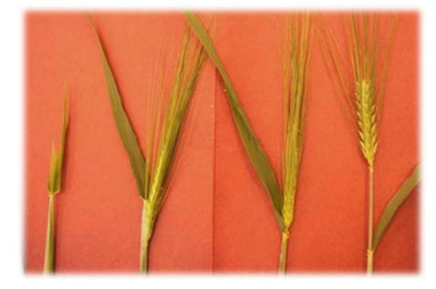
Applications of Fungicide targeting FHB should be made when most of the heads have fully emerged- similar to the third head from the left.