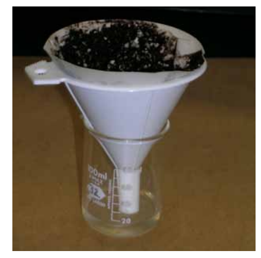
Figure 6. For the saturated media extract and 1:2 dilution methods, pour the samples into a clean funnel lined with filter paper or coffee filters to collect the extract.