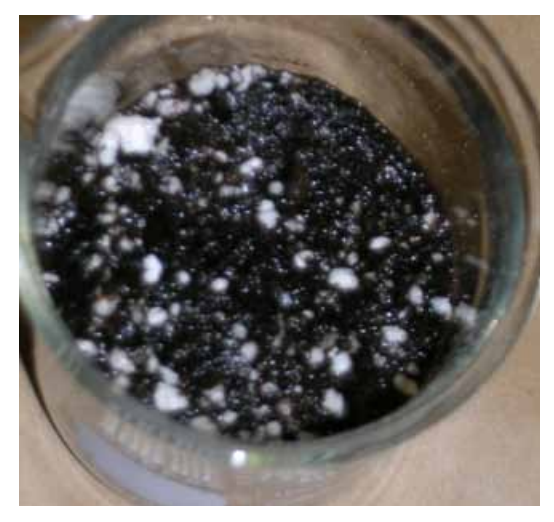
Figure 5. When using the saturated media extract method, the substrate should be saturated, but no free water should be visible on the sample surface.