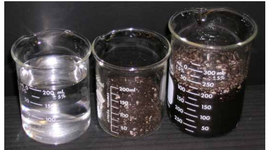
Figure 7. In the 1:2 dilution method, combine one part (by volume) of substrate with two parts (by volume) of distilled water.