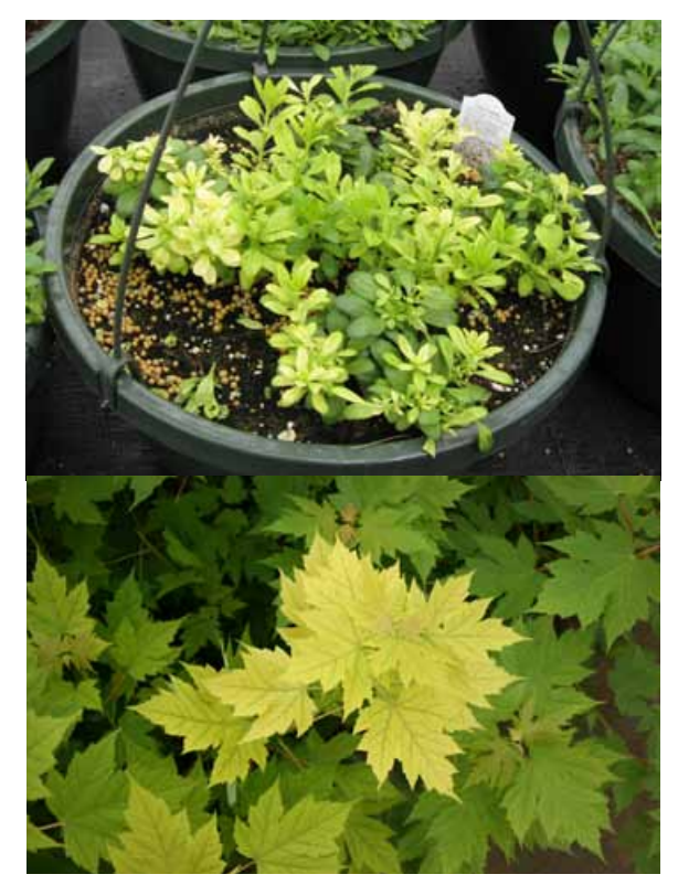
Figure 2. Both this Calibrachoa (top) and this maple show signs of iron deficiency that was induced by high substrate pH.

pH and Electrical Conductivity Measurements in Soilless Substrates