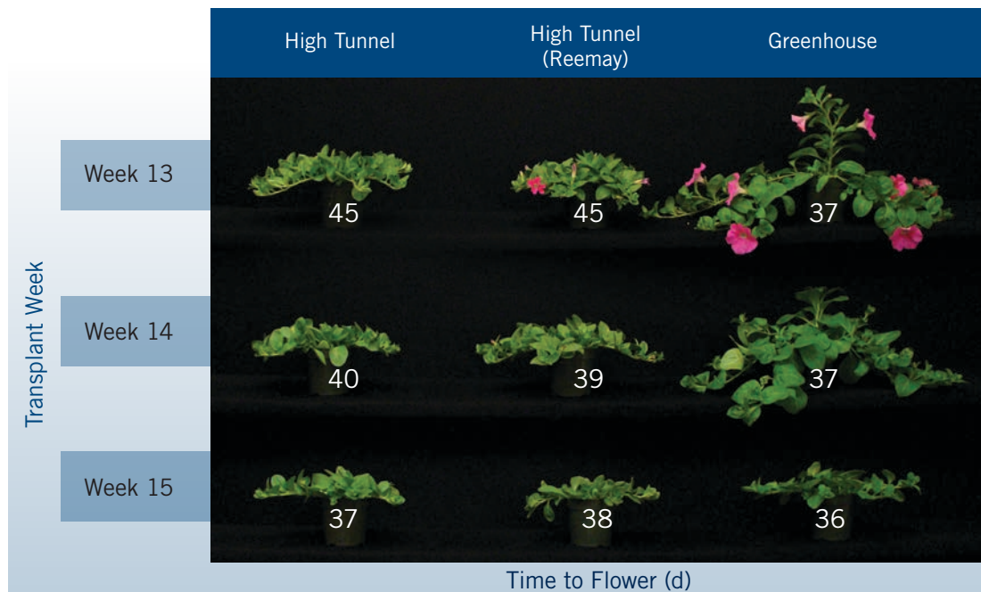
Figure 2. Time to flower (days) of petunia 'Pink Wave' as influenced by transplant week (week 13, 14 or 15) and production environment (high tunnel, high tunnel plus Reemay or greenhouse). Photos of all plants were taken on week 19.

Plants in both high tunnel environments were grown under variable day and night temperatures with a natural photoperiod. Ventilation in the high tunnel was provided by manually operated end wall peak vents, end wall doors and roll-up side walls. End wall peak vents were opened when the forecast high was greater than 55°F, end wall vents and doors were opened when the forecast high was greater than 70°F and vents, doors and roll-up side walls were opened when the forecast high was greater than 75°F.