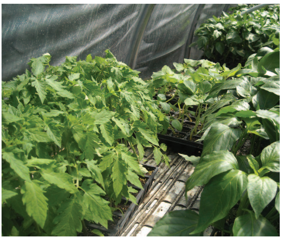
An electric water heater and rubber tubing is used to provide root-zone heat to this high tunnel. Hoops used for the Reemay fabric providing secondary cover are visible in the background.

Their heating costs for the spring season are $125.00. Ron and Kate Khosla offered some tips: place foam insulation board on wooden benches, then place rubber tubing on top. This keeps heat at the root zone. They re-wired their 80-gal. heater so both heat elements operate at the same time, providing more heating power during cold nights. Reemay fabric provides a secondary cover to further trap heat on cool nights. Finally, the Khoslas note that only 500 sq. ft. of their tunnel is heated bench space. The rest of the floor space is used for hardening off transplants before they go outside.