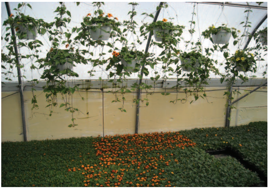
Insulation of the greenhouse perimeter saves heat.

9. Insulate the perimeter of your greenhouse. This has one of the shortest paybacks on investment (potentially less than one year according to John Bartok). If you are constructing a new structure, consider adding a 1- to 2-in. rigid foam insulation below grade, 18 in. to 24 in. deep, around the perimeter. At a depth of 24 in., the costs should be around just over $1.00 per linear foot. Although more difficult, you could also add this perimeter insulation below grade to existing houses. If you're dealing with existing structures and the thought of digging an 18- to 24-in. trench around the perimeter of your greenhouse sounds less than exciting, think about other places you can insulate easily. The glazing materials we use are excellent at transmitting light, but also lose heat easily. Often, there is a considerable amount of greenhouse glazing that provides little to no benefit to light transmittance. Think about the 2 ft. to 3 ft. below your benches; adding a layer of insulation in these areas translates into substantial savings.