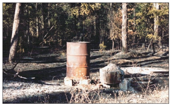
Figure 2. One-third of Michigan wildfires are caused by debris burning.

Wildfires can start in many ways, but about 98 percent of fires are caused by human activities. One-third of all wildfires are caused by people burning debris (household and yard waste, Figure 2). A moment's inattention or an unexpected change in the weather can rapidly turn a debris fire into a wildfire. Once a wildfire starts, it may be impossible for a homeowner to put out.