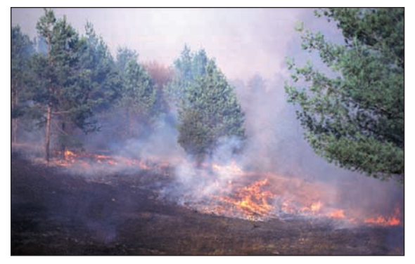
Figure 1. Most wildfires are smaller fires that do not make the evening news.

Typically we think of states such as Colorado, Arizona and California as being prone to wildfires. But Michigan experiences an average of 8,000 to 10,000 wildfires each year. Most of these are small fires that do not make the evening news (Figure 1). But even these small fires can damage or destroy homes and property. Approximately 100 homes are lost or damaged each year by wildfires in Michigan. Wildfires occur in every county of the state. According to the Michigan Department of Natural Resources (MDNR), between 1950 and 1996, the MDNR and the U.S. Forest Service were involved in suppressing 46,100 wildfires that burned 390,000 acres of forest (Michigan State Police Emergency Management Division, 2001).