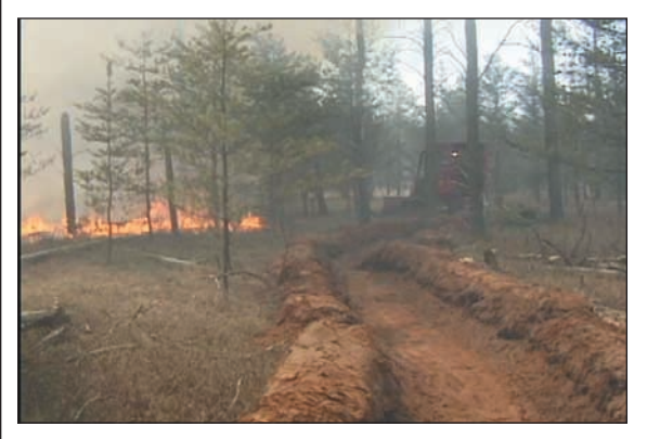
Figure 3. Creating a fuelbreak.

Large wildfires can move rapidly across the landscape, though not like a tidal wave, as is often depicted in the media. A wildfire moves from point to point across the ground as its requirements for heat and fuel are met. If an area contains no fuel, the fire will not go there. This is why wildland firefighters typically control wildfires by removing all vegetation (fuel) down to mineral soil to create a fuelbreak (Figure 3).