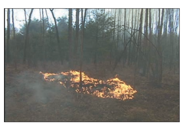
Figure 5. Firebrands can start new fires.

It's firebrands that pose the greatest danger to homes — far more than the flames themselves. These wind-driven embers can be blown under decks and porches, into cracks in the foundation, and into attics through faulty eave and roof vents. They can also land in combustible vegetation adjacent to the home and ignite it, and these flames then can ignite the home. This makes the area within 3 feet of the home the most important. Firebrands can land here and ignite a new fire at the home's most vulnerable point.