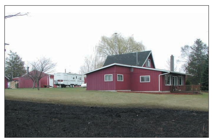
Figure 4. Wildfires cannot burn where there is no fuel.

The amount of radiant heat a wildfire can transfer to your home depends on how far the fire is from the structure and how long it stays there. Research has shown that it is impossible for the radiant heat from a wildland fire to ignite a typical wood-sided home from more than 100 feet away. In fact, in simulations with actual fires and in case studies, homes as close as 33 feet from a wildfire have survived if the flames cannot actually touch the structure (Figure 4).