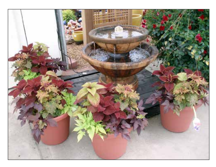
Coleus and sweet potato vine are a nice mix of foliage colors and textures for the sun.