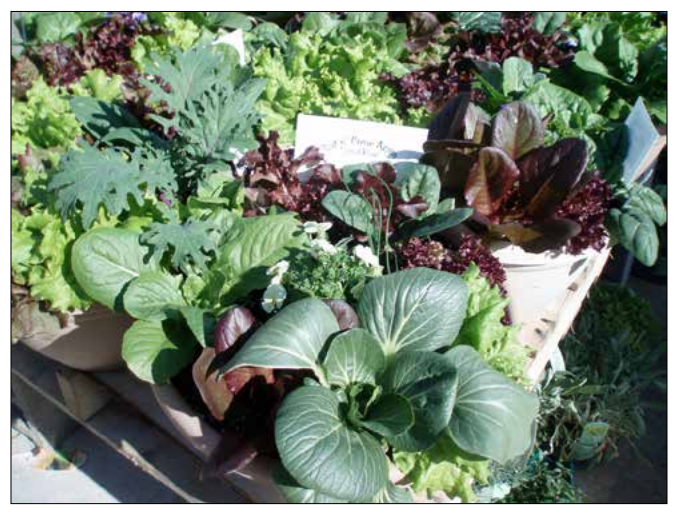
Lettuces can be combined into a fun and tasty container garden that can be cut weekly.

Plastic containers are lighter in weight and can be more easily moved from one spot to another, if you like to move containers as you might move your furniture. Resin containers look like clay or terracotta, but are also lightweight and easily moved. Real clay and terracotta containers are heavy and may not be as easily moved. Concrete, iron, and other materials may not be moved much, if at all. Hanging basket containers may not have solid sides, but have coconut coir or other natural material sides.