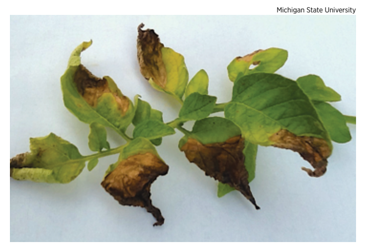
Figure 6. Lesions eventually turn to black necrotic tissue. These dead leaves serve as an overwintering environment for sclerotia.