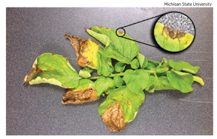
Figure 3. Tan lesions can be seen on the margins of leaves during the intial stages of disease. Over time, the lesions progress toward the primary vein.