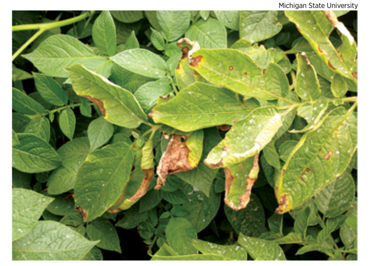
Figure 4. Initial stage of infection on the leaf margin.