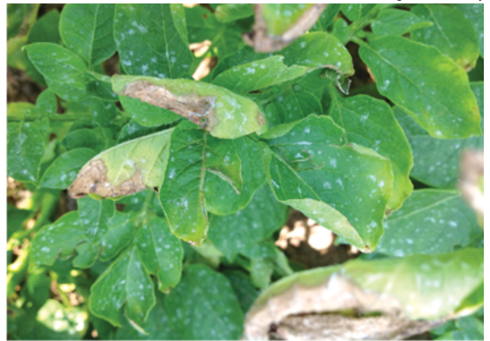
Figure 5. As the disease progresses, lesions become larger and necrotic.