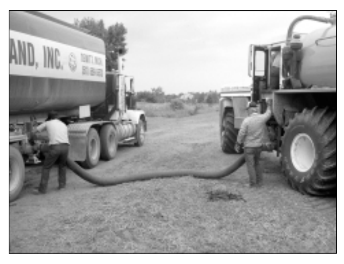
Liquid biosolids are transported to agricultural fields by large tankers and then transferred to applicators for injection into the soil (Benton Harbor-St. Joseph land application program).

One type of biosolids that is becoming more common recently is dried and/or pelletized biosolids. Because producing biosolids in this form is complex and expensive, dried biosolids are often blended with other materials and marketed as an organic-based fertilizer with balanced nutrient levels. Alkaline stabilization has been used to produce a nearly