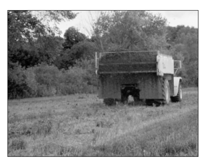
Applying Class A, EQ solid biosolids from Delta Township (Grand Ledge) to cropland for incorporation into the soil.

In addition, the Part 24 Rules include the following condition that expands the Part 503 definition of agronomic rate: