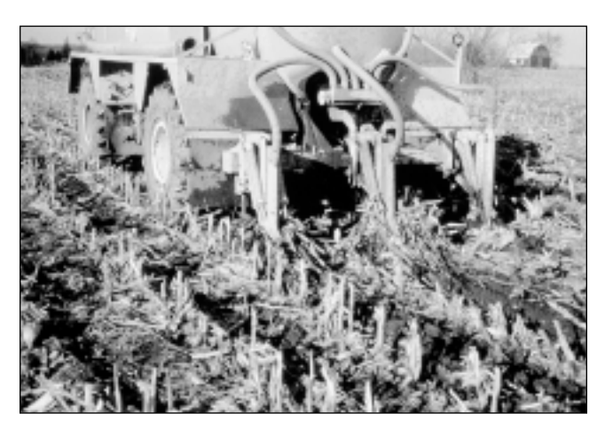
Applying liquid biosolids from the West Bay County TWTDS to cropland by injection into the soil.

Research and experience have shown that biosolids can be beneficial both as a soil conditioner and as a source of nutrients. Biosolids contain appreciable