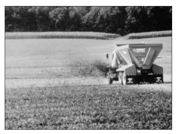
Side-delivery spreaders can apply solid biosolids very uniformly when using the surface application method.

The factor of greatest concern 10 to 20 years ago was high concentrations of heavy metals in biosolids. However, metal concentrations have been significantly reduced by industrial pretreatment programs mandated for industries discharging into sewage collection systems since 1980. To illustrate this decrease, Figure 2 shows the quality of biosolids produced in Michigan in 1980 charted against the average concentrations found in biosolids in 1995 and 1997. These concentrations are also compared with the Part 503 PCLs and CCLs. These data reflect the decline in pollutant concentrations during the