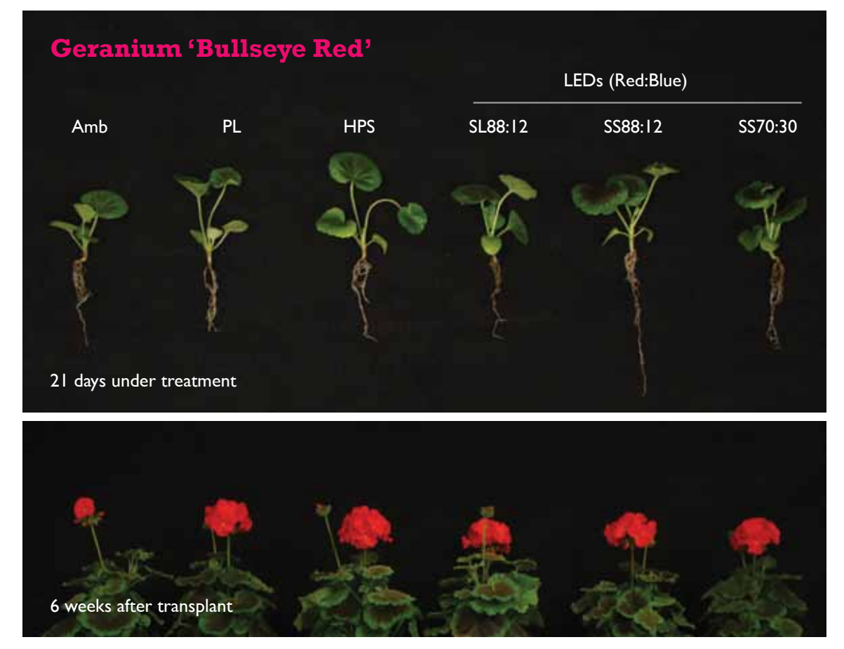
Figure. 5. Plug quality and subsequent flowering of geranium plugs grown under ambient solar light, supplemental lighting (SL) from plasma lamps (PL), high-pressure sodium lamps (HPS) and LEDs (SL88:12) delivering 70 µmol·m<sup>-2</sup>·s<sup>-1</sup> or sole-source (SS) LEDs (SS88:12 and SS70:30) in a vertical production system delivering 185 µmol·m<sup>-2</sup>·s<sup>-1</sup>.