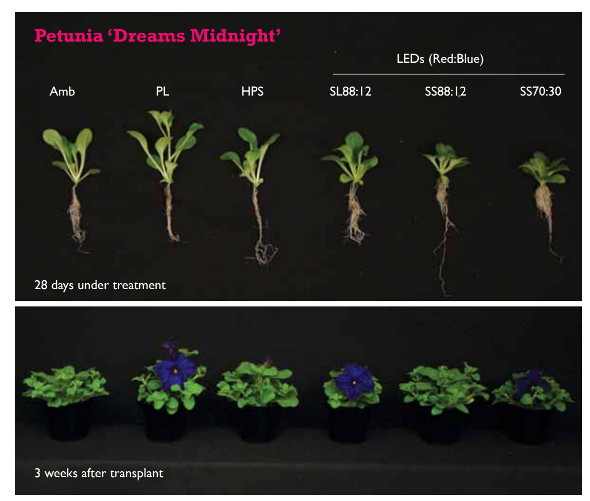
Figure 4. Plug quality and subsequent flowering of petunia plugs grown under ambient solar light, supplemental lighting (SL) from plasma lamps (PL), high-pressure sodium lamps (HPS) and LEDs (SL88:12) delivering 70 µmol·m<sup>-2</sup>·s<sup>-1</sup> or sole-source (SS) LEDs (SS88:12 and SS70:30) in a vertical production system delivering 185 µmol·m<sup>-2</sup>·s<sup>-1</sup>.