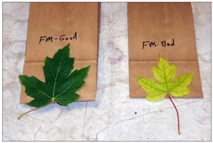
Visual symptoms of nutrient deficiencies include poor growth and color (right)

Soil testing. The Michigan State University Soil and Plant Nutrient Laboratory provides a standard soil test and recommendations for trees and shrubs. Soil test kit self-mailers are available for purchase from most county Extension offices, or the MSU Extension Bookstore (www.bookstore.msue.msu.edu), item E3154. Test results include soil phosphorus, potassium, calcium, magnesium, soil pH and soil organic matter. If the test indicates nutrient levels are low, a recommendation for fertilization will be included in the results. Soil pH is especially