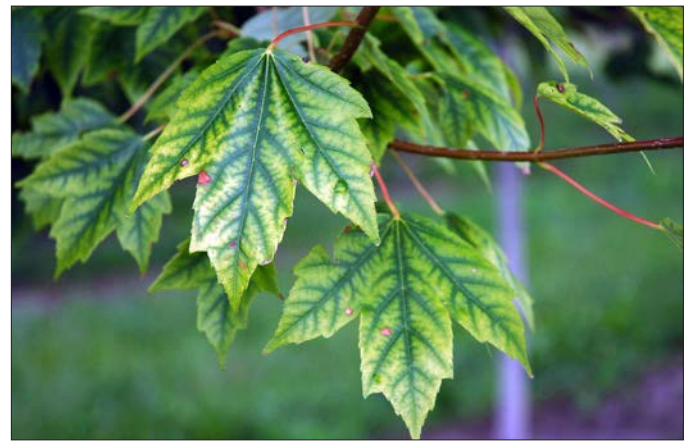
Interveinal chlorosis of red maples often indicates a manganese deficiency

For example, if we were fertilizing a 10 ft. x 50 ft. bed at