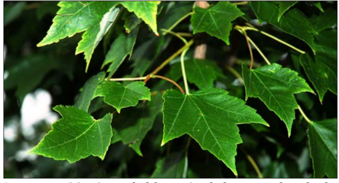
Proper nutrition is needed for optimal plant growth and color

reduced nutrient availability associated with other factors, often high soil pH. Nutrient elements that are needed in the largest quantities are termed macronutrients. Micronutrients, in contrast, are elements needed in very small or trace amounts. When analytical laboratories run a foliar analysis to determine the chemical composition of leaves, macronutrients are usually expressed as a percent (%) of leaf dry weight, whereas micronutrients are expressed in parts per million (ppm).