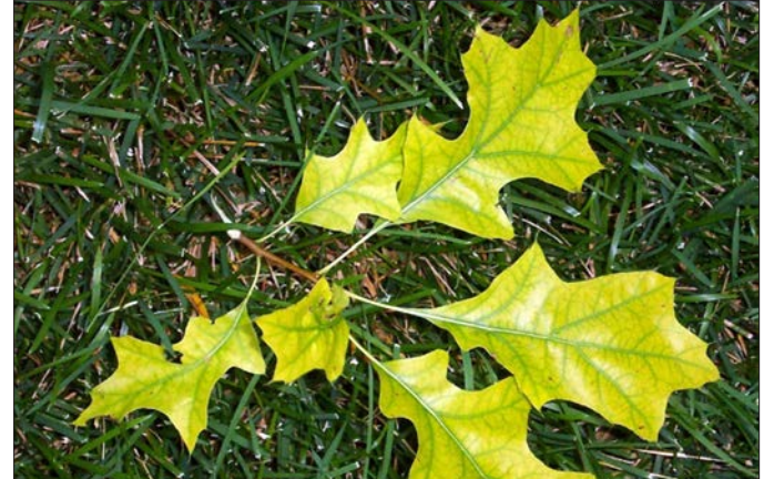
Interveinal chlorosis of pin oaks often indicates an iron deficiency

Some responses of trees and shrubs to fertilization may occur fairly rapidly. Trees that are deficient in nitrogen, for example, may show improved leaf color within a few weeks of fertilization. Other responses, such as reducing pH to correct iron or manganese deficiencies, may require a full season or longer to show a response. Follow-up soil tests and re-application may be needed.