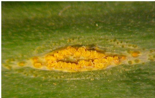
Aeciospores (spring to early summer).