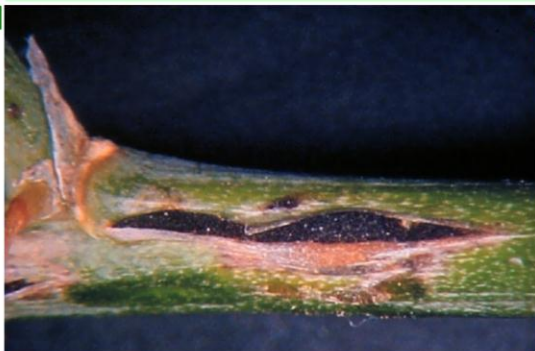
Teliospores (mid-summer to winter).