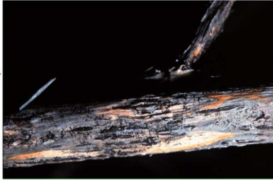
Basidiospore residue (early spring).