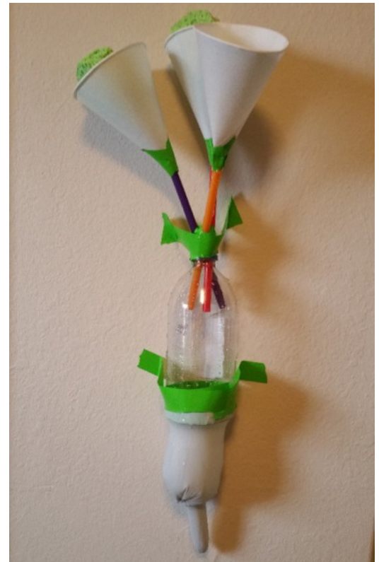
Figure 2. Completed model of a mammary gland system after water is added.

When milking a cow, the udder and milking equipment are cleaned and disinfected and the milking takes place in a clean area to prevent bacteria from entering the teat. The individual will hold the teat with two fingers while using the other three to force the milk out of the teat.