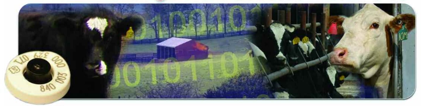
Selection Considerations for RFID-based Individual Beef Cattle Management Systems <sup>1</sup>

B efore investing in the components of a radio frequency identification (RFID)-based individual animal management system, you need to consider several questions. This bulletin outlines general criteria that may be part of purchasing decisions about the four basic components of an RFID individual management system: tag (transponder), reader (transceiver), computer/scale indicator (data accumulator) and management software. This bulletin does not attempt to compare components directly, because they rapidly change.