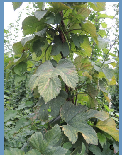
Figure A. Symptoms of two spotted spider mite damage on hop. Figure B. Underside of infested leaf with webbing and dusty appearance. Figure C. Leaf bronzing caused by mites.