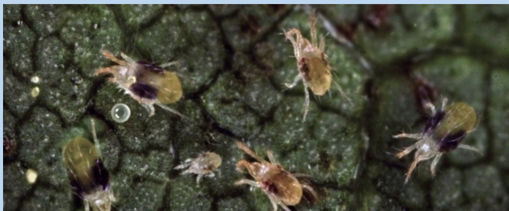
Two spotted spider mite adults, larvae and eggs under magnification.