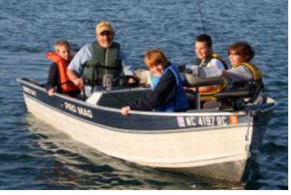
4-H Great Lakes and Natural Resources Camp participants explore nature at Camp Chickagami in Presque Isle.

From August 5 to 11, 4-H youth with an interest in the outdoors have the opportunity to engage in an amazing outdoor, hands-on learning experiences at the 4-H Great Lakes and Natural Resources Camp (GLNRC). Held annually at Camp Chickagami in Presque Isle, camp participants get to go charter fishing, snorkeling, sailing and hiking, while learning about Great Lakes ecology, natural resources and environmental education.