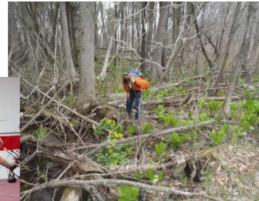
Plant & Track I.D.

Michigan State University is an affirmative-action, equal opportunity employer. Michigan State University Extension programs and materials are open to all without regard to race, color, national origin, gender, gender identity, religion, age, height, weight, disability, political beliefs, sexual orientation, marital status, family status or veteran status.